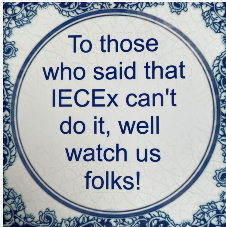
Tile : IECEx Conference Shanghai (2017)