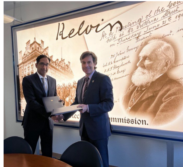
Signing of the renewed MoU in Geneva on 14 November 2023.